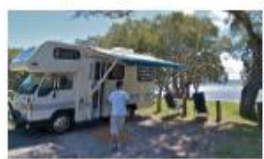
Camping in Mungo Brush Rainforest (Lake Macquarie NP)

Experience the cultural heritage and giant eucalypt trees at Dark Point or enter another ancient world along the Mungo Brush Rainforest Walk. The heritage-listed Sugarloaf Point Lighthouse at Seal Rocks is a testament to maritime navigation and now provides visitors with the chance to stay overnight below the beckerling light. The coastal forests along the western side of the park include the state's tallest tree – the Grandis – a giant flooded gum.